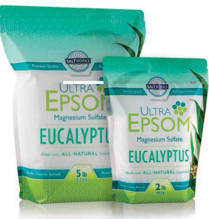
AVAILABLE IN 2lb | 5lb | 18lb (Lavender & Unscented)