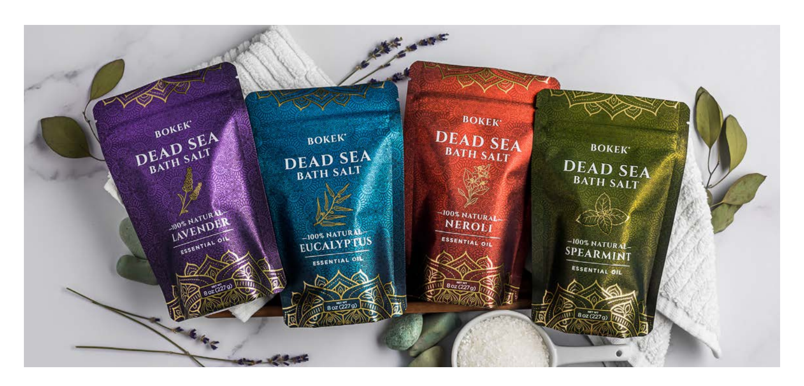
AVAILABLE IN 8oz | 21oz | 2lb | 5lb